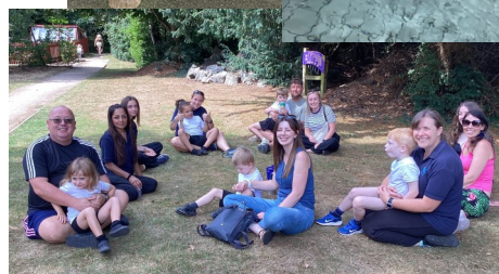
Sports Day Fun!