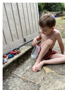
Summer Fun Day!