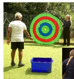
Outdoor fun in the sunshine

Peacock Class had a fantastic time at Sports Day last week, it was so lovely to have our parents and families come to support us and cheer us on! On Thursday for Summer Fun Day we spent the morning in the paddling pool, splashing and using water shooters to squirt each other. We used the slip 'n' slide on the upper lawn and then some of us chose to get our faces painted! We had a picnic lunch and then watched a film in the classroom. On Monday we had so much fun at our transition morning, sharing activities with our new classmates and meeting our new adults. For those who were moving classroom we saw our new rooms and did some fun 'getting to know you' activities.