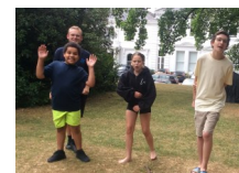
Summer Fun Day