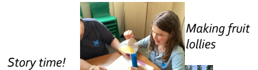
Making fruit lollies