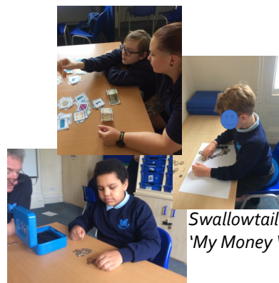
Swallowtail enjoying 'My Money Week'.