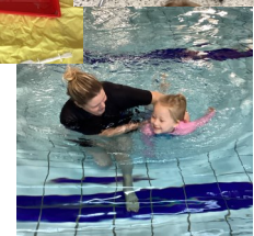
Fun at swimming