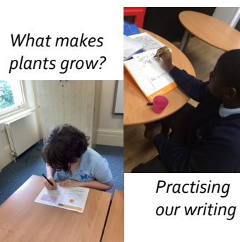
What makes plants grow?

Admiral Class enjoyed a trip to Leatherhead this week to visit an art gallery. We looked at paintings and sculptures which gave opportunity to discuss their thoughts and ideas about the art work. Within our topic lessons we have been looking at Picasso's work and the method that he used to create his art. In our Jigsaw session we have started a new topic, looking into the changing body. It was great to see Admiral Class cycling this week and continuing to build on their fitness levels. In Science, some learners have been learning about how the sun's light and heat are needed for plants to grow.