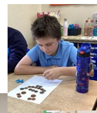
'My Money Week' activities