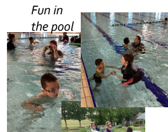
Fun in the pool