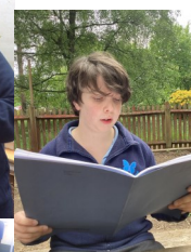
Working on our class stories