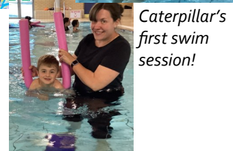
Caterpillar's first swim session!