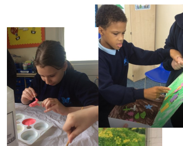
Topic work in Peacock Class