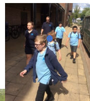
Having fun in the sunshine!