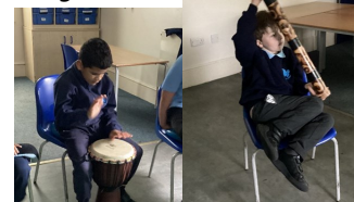
Exploring in music