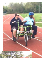
Admiral enjoying their first cycling session

Admiral Class have enjoyed hearing what everyone has been doing in their Easter holidays. This week Admiral Class started our new topic of ‘My Place in my Local Community’. We have had group discussions about the local shops in our communities and how everyone’s community is different. We started our new off-site physical activity, and we will be cycling every Thursday morning. For our first week back we made fruit salad using pineapple, strawberries and mango. Some of the pupils have also been looking after the sunflowers that we planted in the spring which continue to grow well.