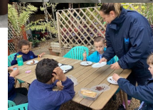
Knights Garden Centre Café