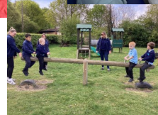
Fun in the park