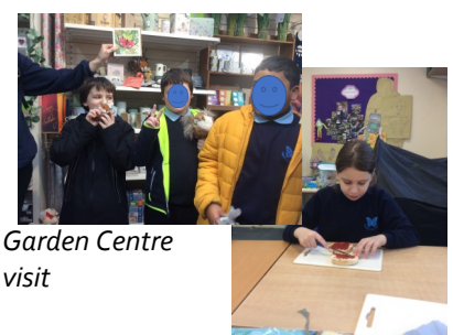
Garden Centre visit