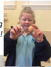
First chicken egg of the year!