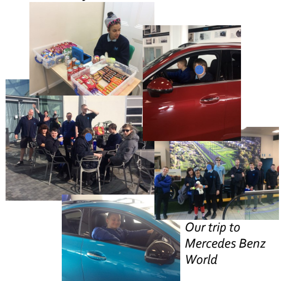
Our trip to Mercedes Benz World

Emperor Class have had a busy and enjoyable first three days back at school after the break. On Thursday, the students worked really hard to prepare 21 portions of 'bangers and mash' with onion gravy for cafe - there were a lot of potatoes to peel! On Friday we joined Admiral Class for a trip to Mercedes World where we got to sit in some amazing supercars, watch some cars driving around the tracks and try out a Reaction Challenge. We were lucky that it was such a beautiful sunny day allowing us to sit in the sun for our snack.