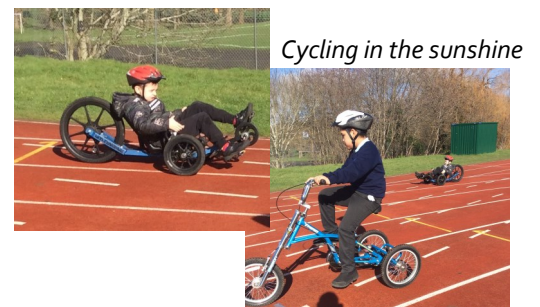
Cycling in the sunshine