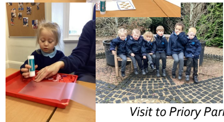
Visit to Priory Park