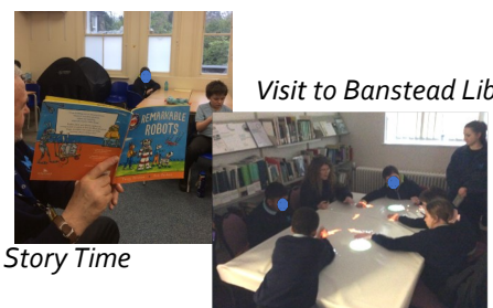
Visit to Banstead Library