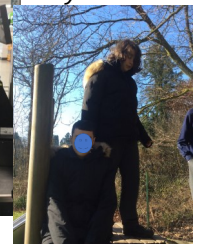
Playtime in the sun!

Emperor Class had a great time at the gym on Monday, where everyone got in a good workout before heading to the café for a well-earned drink. We also took a trip to Lidl to pick up the ingredients for our weekly café shopping. This week, we've been busy preparing a variety of dishes, including Chicken Pesto Pasta, Chorizo, Tomato and Basil Salad, Mozzarella and Tomato Salad, Apple Crumble, and Chocolate Chip Cookies! In the classroom, we've continued our discussions about the future and have been working on enhancing our money management skills in Maths.