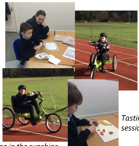
Cycling in the sunshine