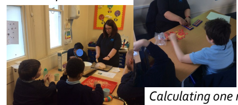
Calculating one more and one less