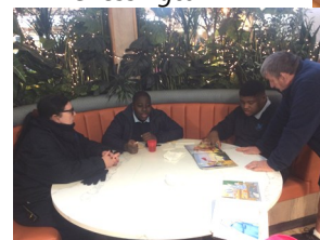
Snack time at Chessington