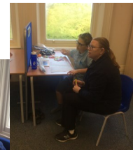
Learning our maths