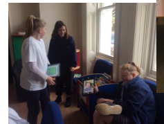
Monarch library session