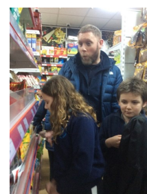
Trip to Foodland