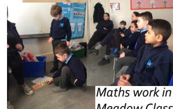
Maths work in Meadow Class