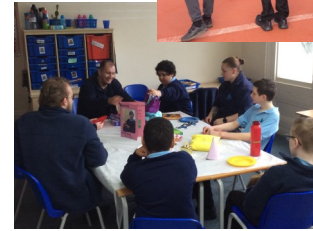
Birthday party time!