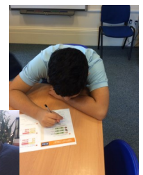
Maths work in Admiral