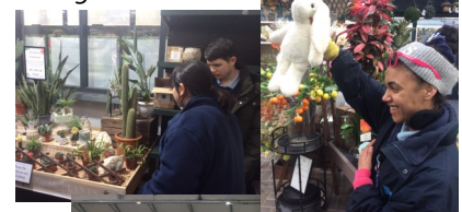
Emperor Class visit the garden centre