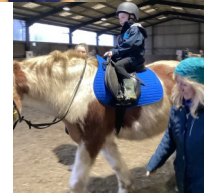
Getting confident at horse riding