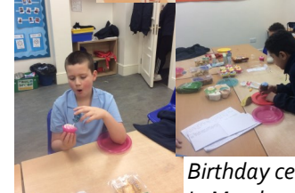
Birthday celebrations in Meadow