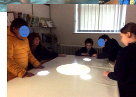
Sensory table at Banstead Library