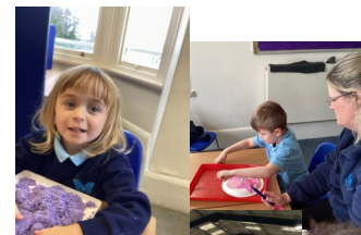
Three Little Pigs