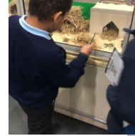
Visiting Pets at Home