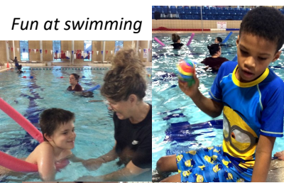
Fun at swimming