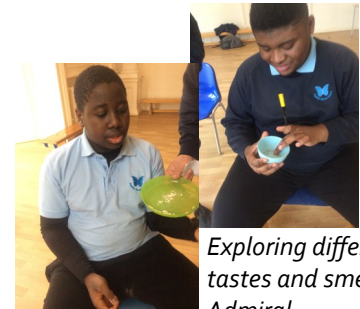
Exploring different tastes and smells in Admiral.