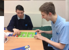
Games in Emperor