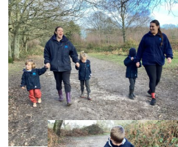
Walks on Headley Heath

Peacock Class started to watch the news roundup to explore about what is happening in the world. We watched what has been happening in Los Angeles recently which led to a topic discussion on how some special firefighting robots can help put out fires. We also made our own designs of robots, and we made them with various materials. On Wednesday we went to Knights Garden Centre to try and find their resident cats! We found a beautiful black one named 'Oreo'. We also found many different plants and flowers there. We went to swimming on Tuesday, at Dorking Leisure Centre and enjoyed being in the water for the whole swimming session. Finally, we had a lovely cooking lesson making chocolate cookies and hot chocolate with marshmallows!