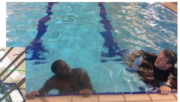
Admiral Class enjoying swimming