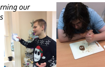
Learning our lines