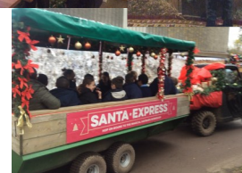
Feeling festive at Bocketts Farm