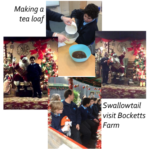
Swallowtail visit Bocketts Farm