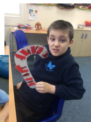
Making candy canes