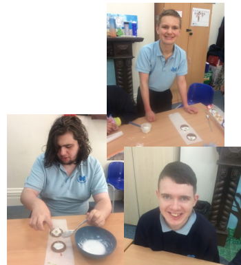
Festive baking in Emperor