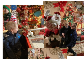
Caterpillar enjoying their trip to Bocketts Farm