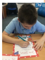
Letters to Santa