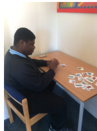
Matching pictures in maths