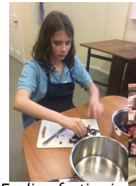
Feeling festive in Monarch