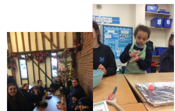
Making coconut barfi balls