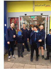
Visit to The Works