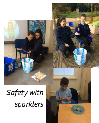
Safety with sparklers