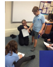
Classwork in Monarch