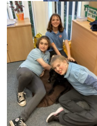
Cuddles with Luna the dog