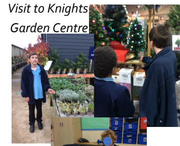
Visit to Knights Garden Centre