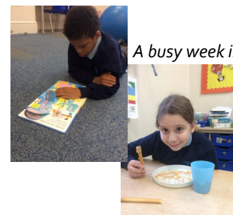
A busy week in Peacock