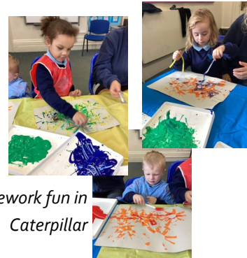
Firework fun in Caterpillar