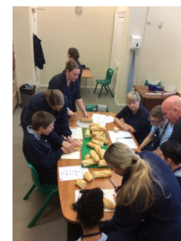
Café prep and class work in Emperor