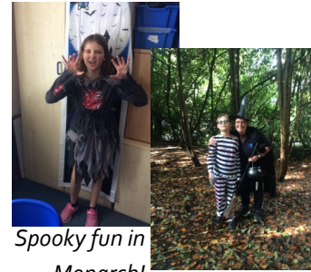
Spooky fun in Monarch!