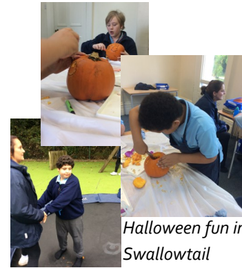
Halloween fun in Swallowtail