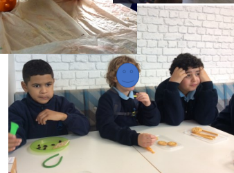
Enjoying a café snack