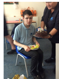
Halloween and birthday celebrations in Emperor