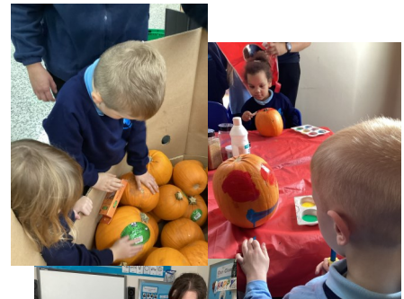
Halloween and birthday celebrations in Caterpillar.