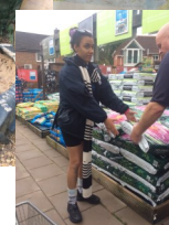
Visiting the garden centre