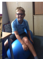
Fun times in Monarch!