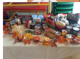
Feeling thankful in our Harvest Festival