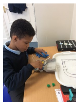
Counting in 10's and 1's