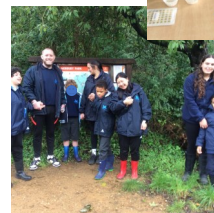
Primary Kaleidoscope trip to Norbury Park