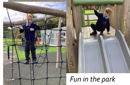
Fun in the park