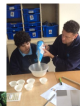
Swallowtail enjoying cooking