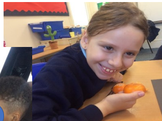
Fun in Peacock Class