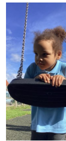
Park fun in the sun!