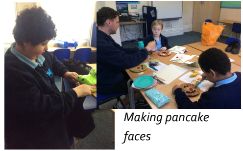
Making pancake faces