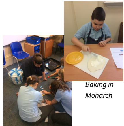
Baking in Monarch