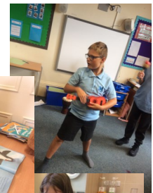
Music fun in Monarch