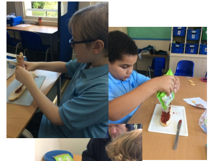
'All About Me' pizzas