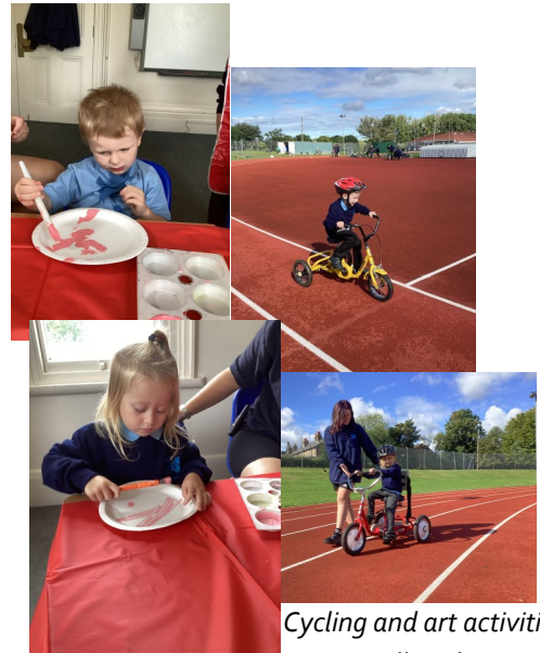
Cycling and art activities in Caterpillar Class