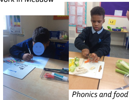
Phonics and food in Peacock!