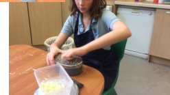
Making cheese straws