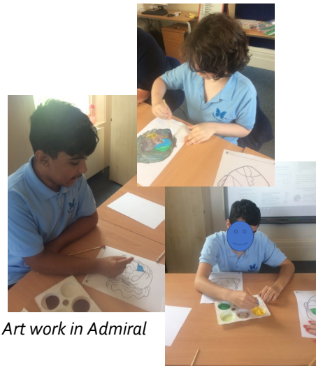
Art work in Admiral