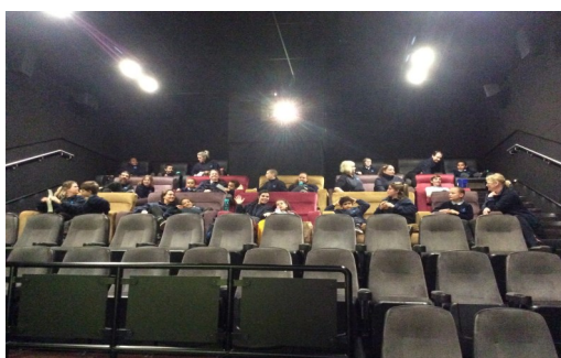
Primary cinema trip to Omniplex Cinema

temperatures and thinking about different objects that are hot and cold. Additionally, all of the children loved our trip to Omniplex cinema on Monday.