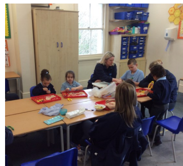
Sensory exploration session

Thank you to the Secondary parents who have returned their tennis consent form. Please can these be returned to us by next Thursday 28th March. A copy of the form is attached.