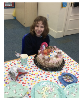
Birthday celebrations and making in Meadow