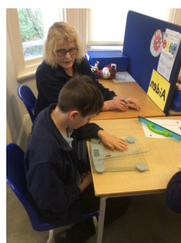
Weighing different objects