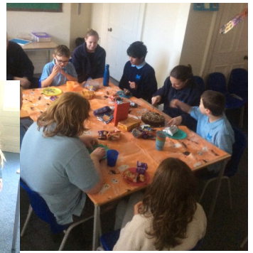
Party time in Swallowtail