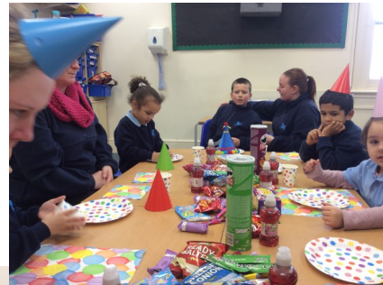
Celebrating birthdays and music day in Woodland.