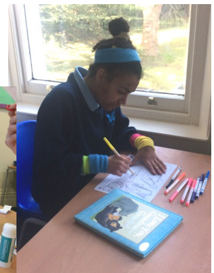
ASDAN work and music science in Admiral