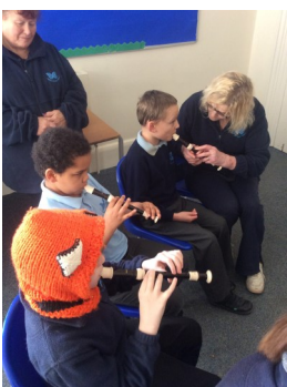
Trying out the recorder