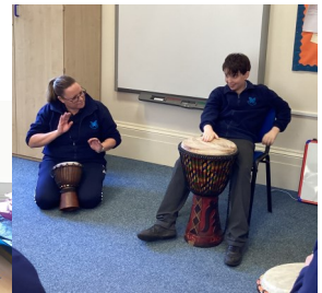
Drumming and art work in Monarch