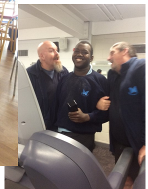
Keeping fit at the gym