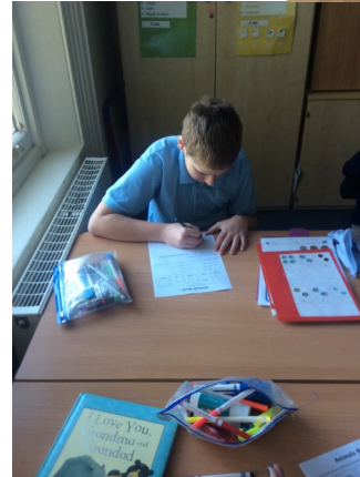
Admiral thinking about what animals need.