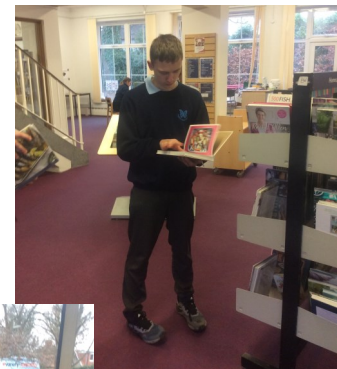
Emperor visited Banstead Library