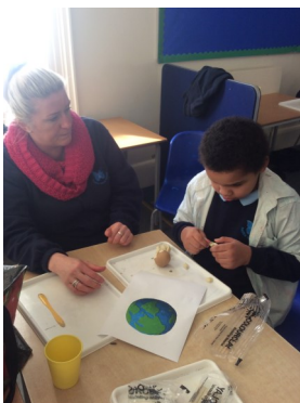
Learning about Climate Change

Peacock Class have continued to learn about their topic of 'Climate Change' this week and more specifically how to prevent it. They created posters on the computers and learnt about pollution in English and topic-based sessions. They also did some observing of plants in science using magnifying glasses. We also had a great swimming session at Dorking Sports Centre.