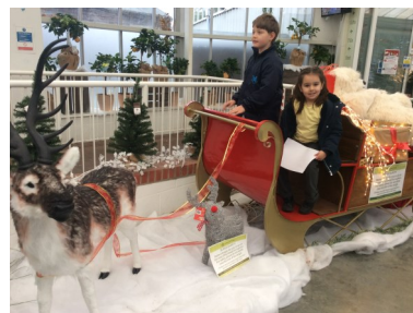
Santa's sleigh and snack time at the Garden Centre