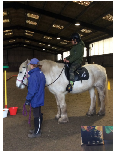
Swallowtail enjoying horse riding