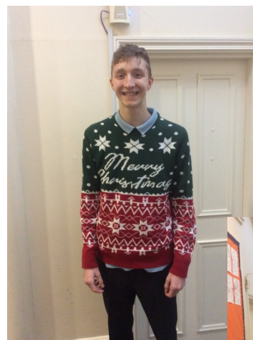
Feeling festive in Admiral