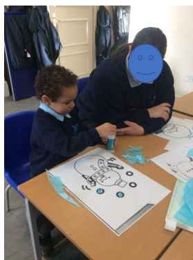
Secondary working with Primary

Emperor Class have been getting into the festive mood this week practicing for the Christmas show in different ways. Some have been learning the script for presenting the show whilst others have been participating on stage or backstage. ALL of Emperor have been preparing 'festive turkey baguettes' in the class café. To achieve this, we have been reading different texts and calculating with money. Huge thanks to Yara who has been helping Woodland Class to complete their morning work on Fridays.