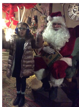
Meadow class meeting Santa