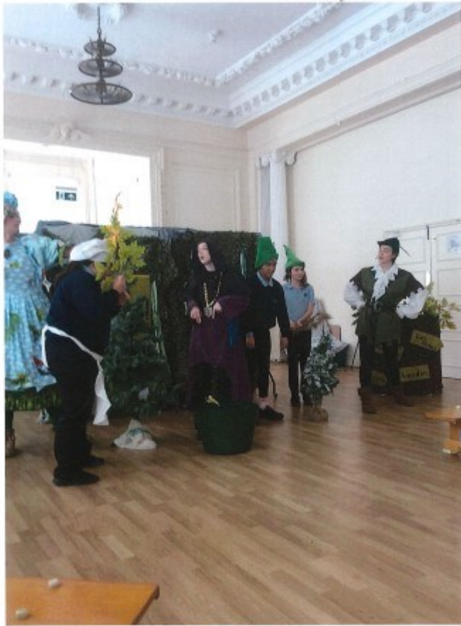
Emperor class reflecting on their pantomime experiences.

i was playing as the cher i enjoyed the Pantom i enjoyed it so much, i like playing as the cher the Pantom was great it was funny and good.