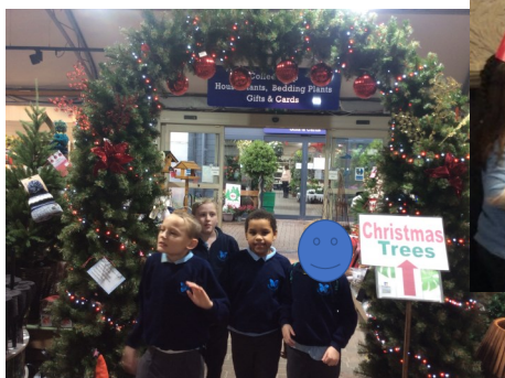
Feeling festive at Knights Garden Centre, Betchworth.

Peacock Class have been busy preparing for the Christmas show. They enjoyed a rehearsal on Wednesday and did a lovely job singing and practicing. They also enjoyed a special "Christmas" themed assembly on Monday where they learnt about Nativity and the first Christmas story.