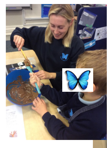
Cooking activities in Peacock class