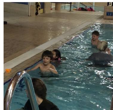
Swimming at Dorking Sports Centre