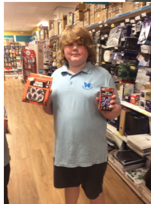
Shopping for Halloween decorations.