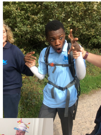
Enjoying the sights on Boxhill.