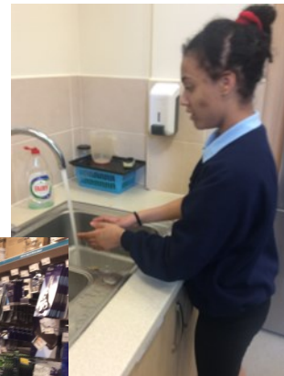
Preparing to make pizzas.