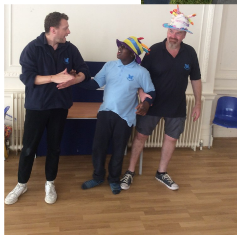
Secondary celebrating birthdays in assembly.