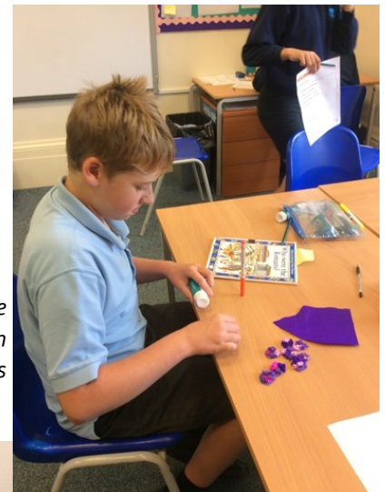
Creative development in Admiral class