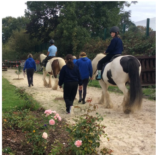
Swallowtail Class enjoying the new sensory trail at horse riding.