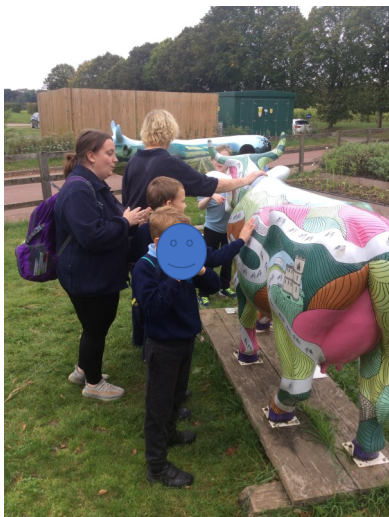
Having fun at Denbies!