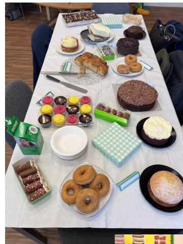
Cakes for our Macmillan coffee morning