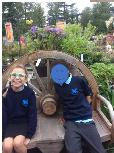
Enjoying time at the garden centre.